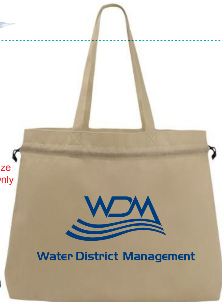
Navy 281 Imprint