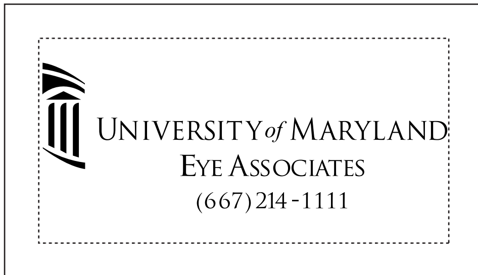
Enlarged for Clarity