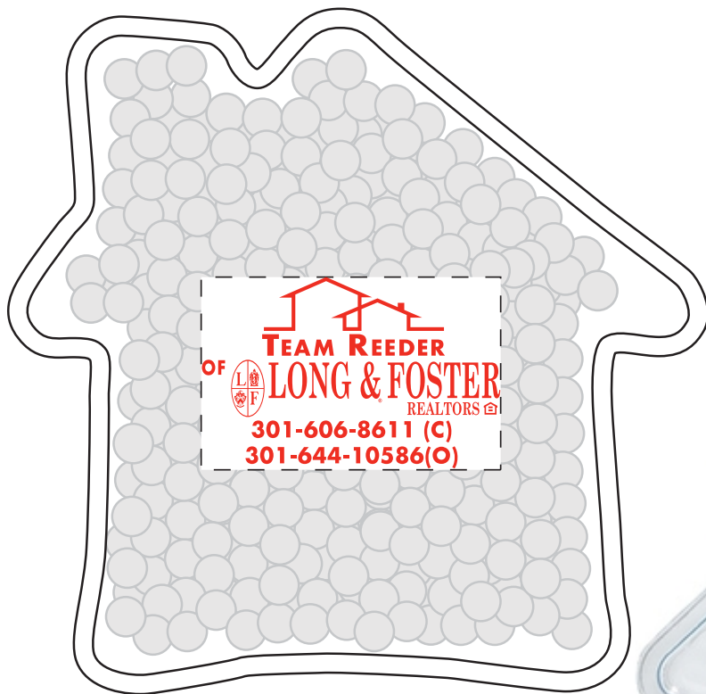
Actual Size of Imprint Dotted Lines Do Not Print

Note: Some small details in the Long & Foster logo may fill in