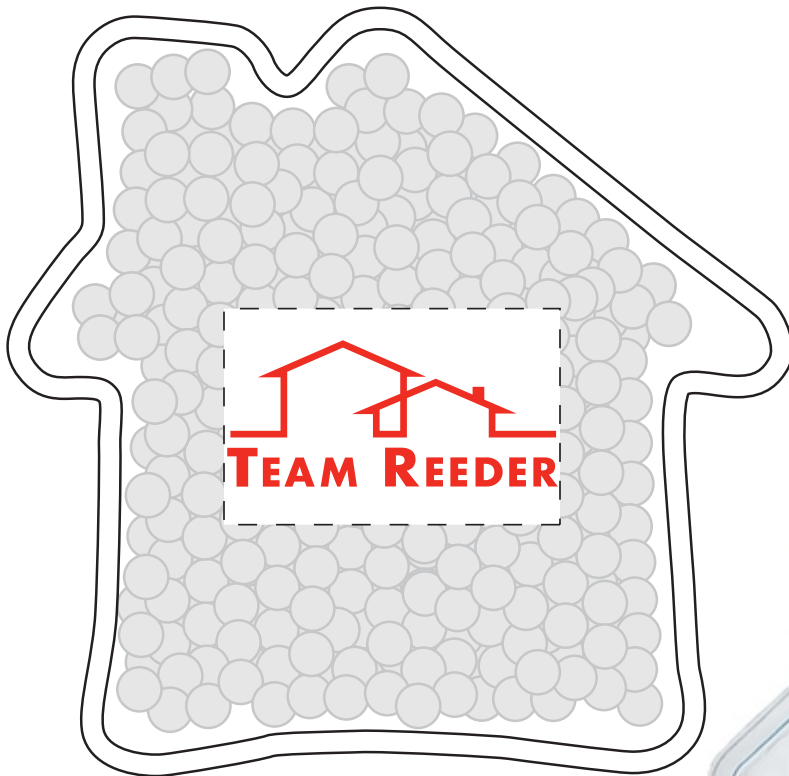
Actual Size of Imprint Dotted Lines Do Not Print

Imprint Method: Screen Print on the Front - Red 485