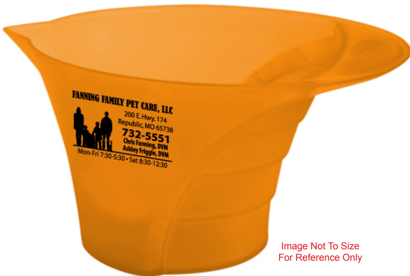
Image Not To Size For Reference Only

Actual Size of Imprint Dotted Lines Do Not Print