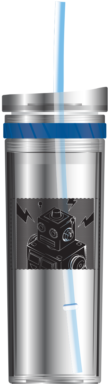
60% OF ACTUAL SIZE

Imprint Method: Silkscreen on the Front - Black