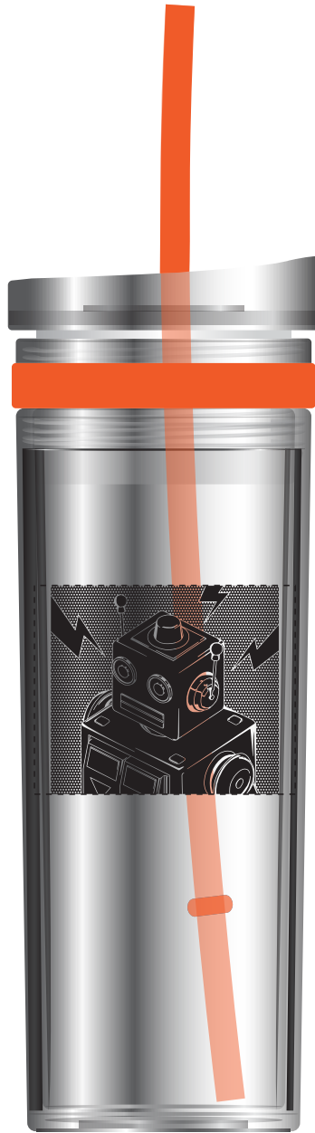
60% OF ACTUAL SIZE