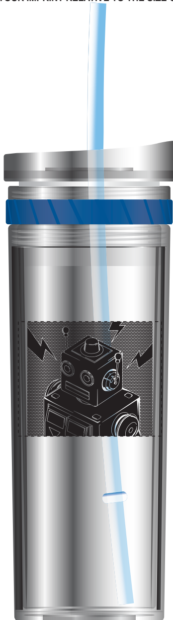
60% OF ACTUAL SIZE

THIS ART PROOF SHOWS THE APPROXIMATE SIZE, COLOR AND PLACEMENT OF YOUR IMPRINT RELATIVE TO THE SIZE OF THE ITEM.