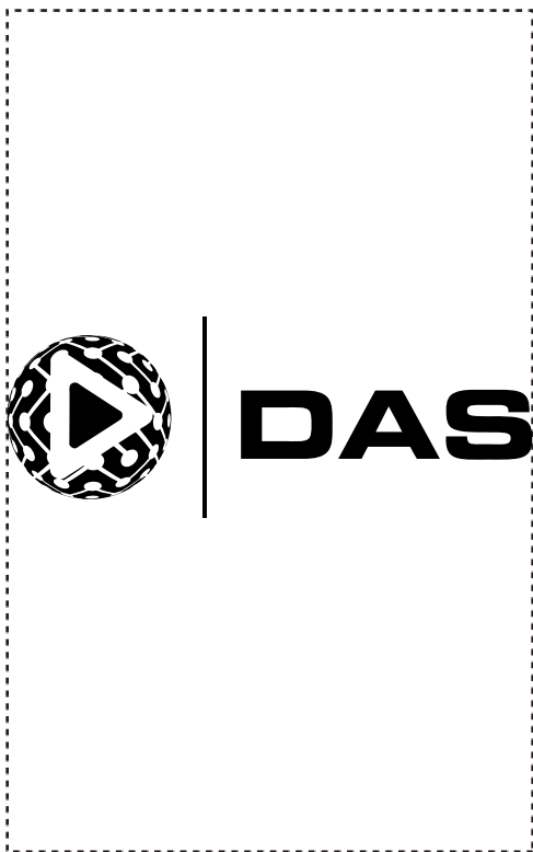
Actual Size of Imprint Dotted Lines Do Not Print

Imprint Method: Screen Print on the Front - Black