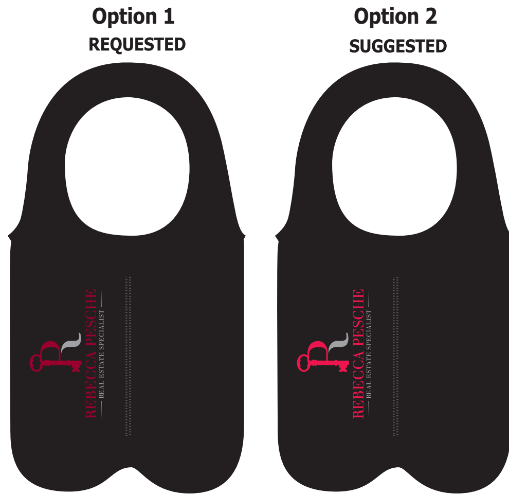
Item shown @ 25% Enlarge @ 400% to see actual size

pms 202 c burgundy imprint will not be visible on this black item. We suggest pms 199 c red imprint. Please confirm.