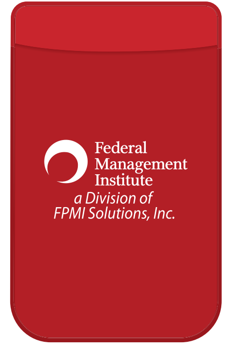
Tagline "A Divsion..." may not be legible. Please see suggested layout.