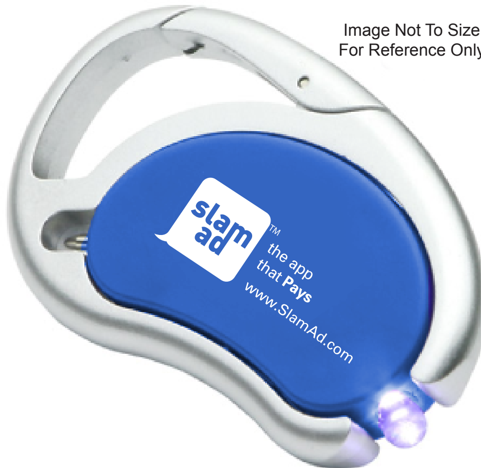
Image Not To Size For Reference Only

Actual Size of Imprint Dotted Lines Do Not Print