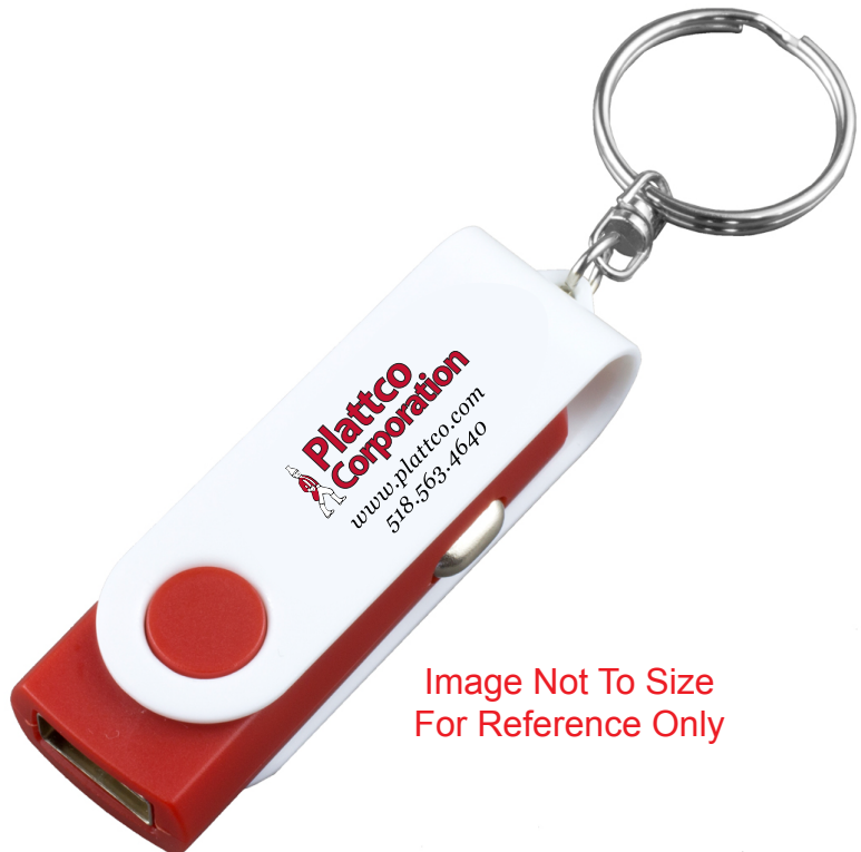
Image Not To Size For Reference Only