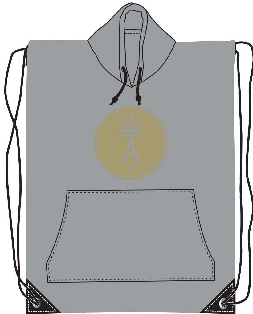
Item & Artwork shown @ 25% Enlarge @ 400% to see actual size

Imprint Method: Screen Print on the Pocket - Metallic Gold 873