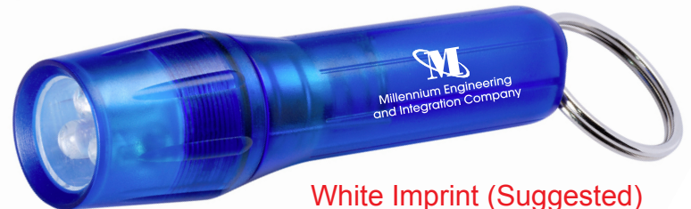
White Imprint (Suggested)

NOTE: Reflex Blue imprint may be hard to see on flashlight.