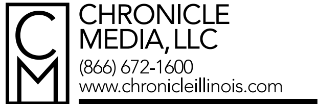
Enlarged for Clarity