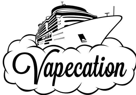
Enlarged for Clarity