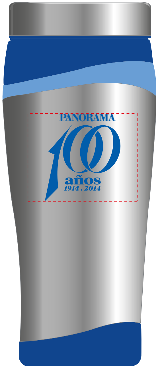
80% OF ACTUAL SIZE

Imprint Method: Screen Print on the Horizontal - Royal Blue 286