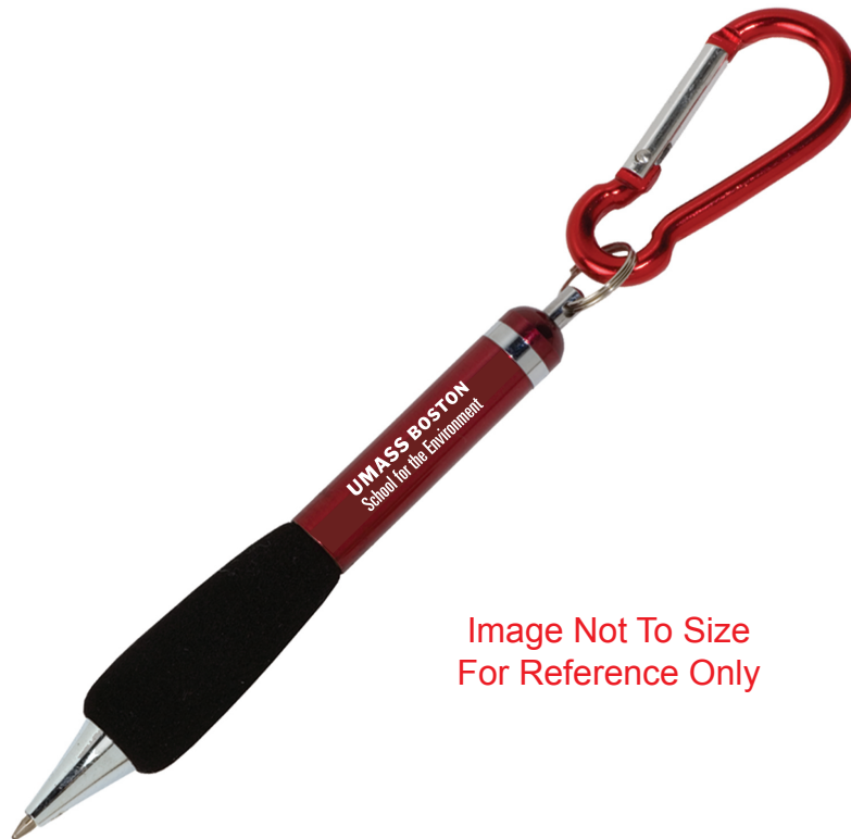
Image Not To Size For Reference Only