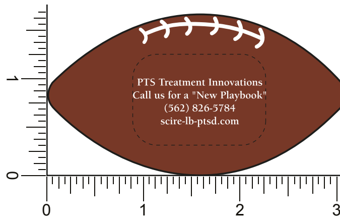
SIDE 1 AND 2

TEXTURED SURFACE OF THE FOOTBALL CAN RESULT IN SOME BREAK-UP OF THE IMPRINT