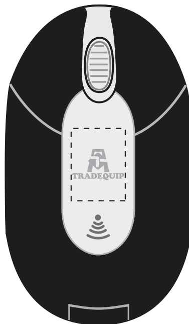
100 % OF ACTUAL SIZE