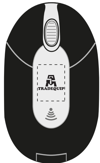
100 % OF ACTUAL SIZE