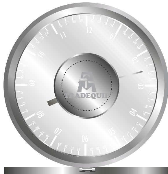
60% OF ACTUAL SIZE