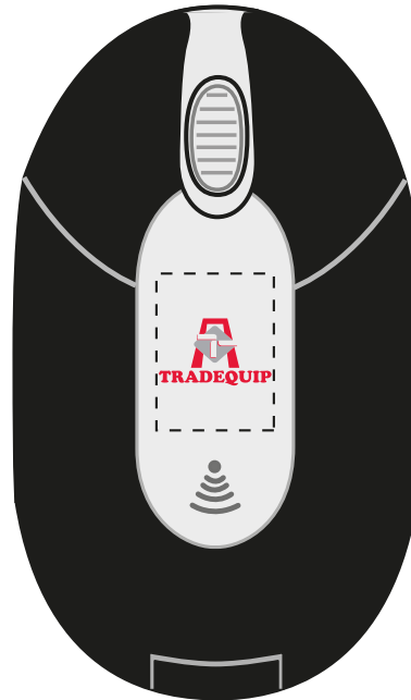
100 % OF ACTUAL SIZE