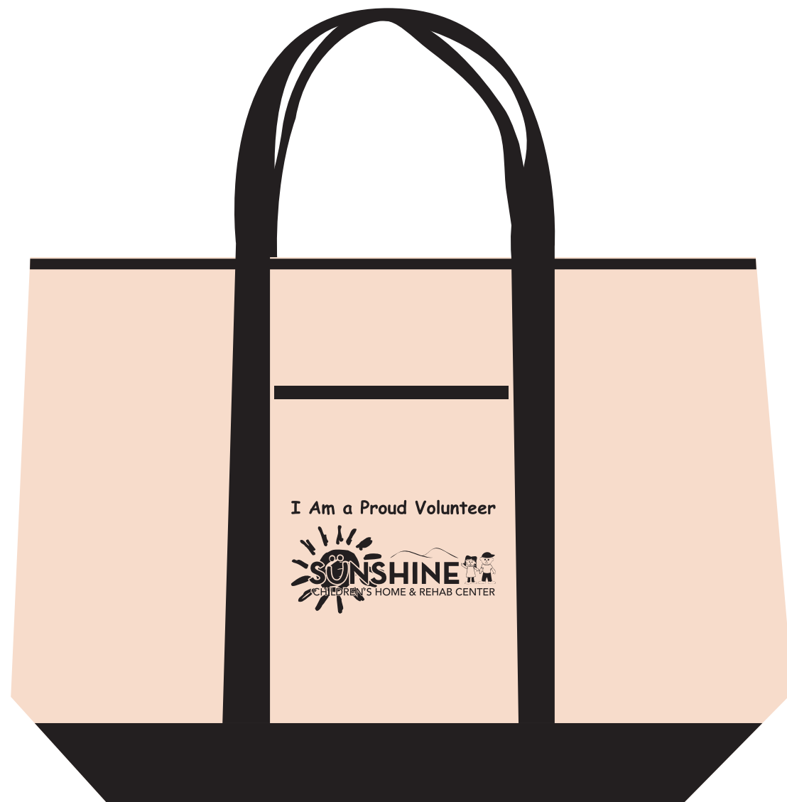
Item shown @ 25% Enlarge @ 400% to see actual size

Order#: 121981 Product: Cape Hatteras Boat Tote - Black Item #: 1097-303907 Imprint Method: Image Bonding on the Front Pocket - Black