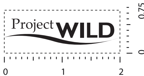
Artwork shown @ 100%