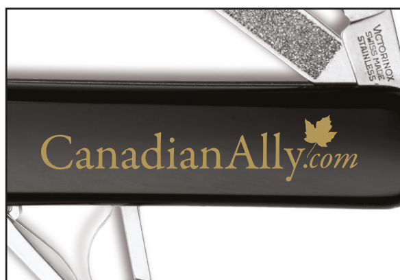
VIEWED AT 166%