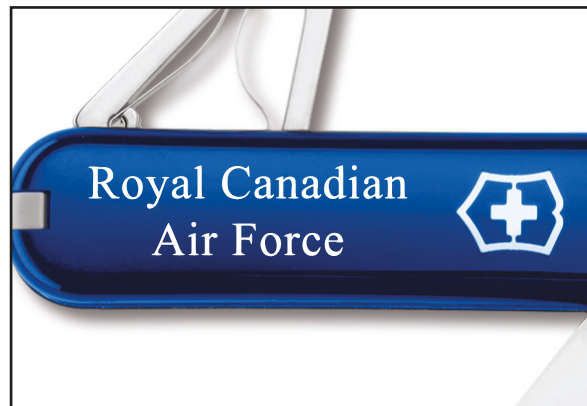
VIEWED AT 166%