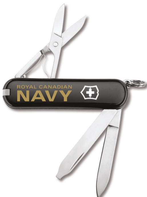
Back With Swiss Cross - 5/16"H x 1"L