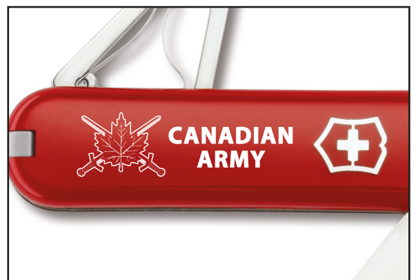
VIEWED AT 166%