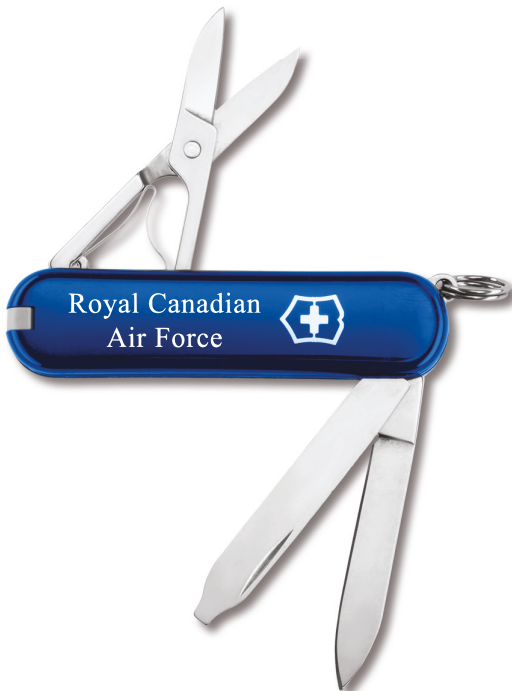
Back With Swiss Cross - 5/16"H x 1"L