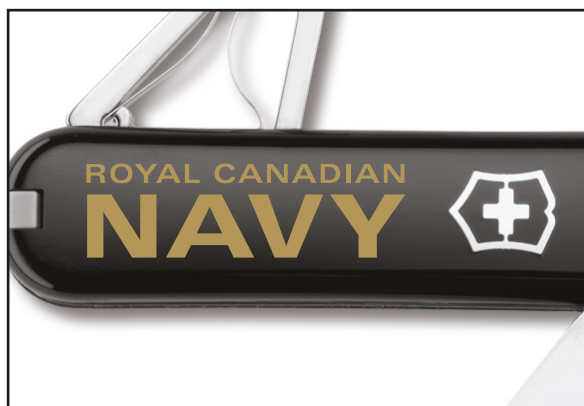
VIEWED AT 166%