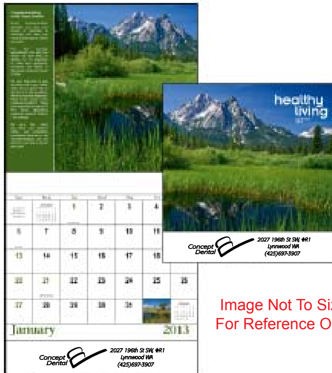
Image Not To Size For Reference Only