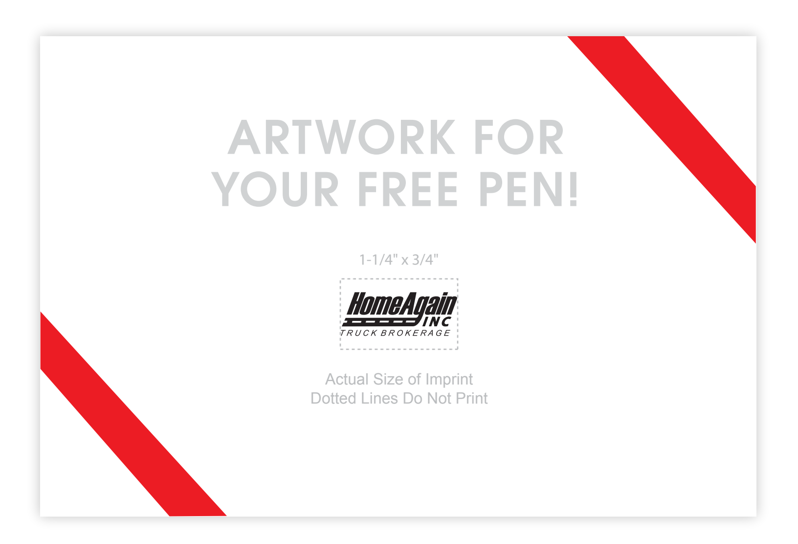
IMAGE IS FOR REFERENCE ONLY. COLORS, SIZE, AND APPEARANCE MAY DIFFER ON ACTUAL PRODUCT.

250 Pens with your logo FREE with any order $500 or more (BEFORE SHIPPING). Black imprint only. Our art dept will place your logo and/or one line of text to best fit the imprint area. Pens and pen color will be picked at random. Includes standard production and ground shipping within the continental US only. Other restrictions may apply. Limited time only.