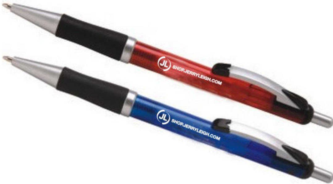
Image Not to Size For Reference Only Imprint size and location are approximate