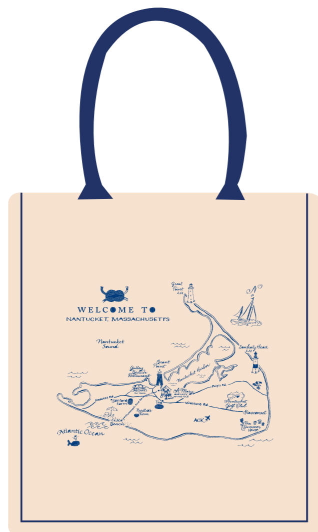
Item shown @ 25% Enlarge @ 400% to see actual size

★ PLEASE NOTE: Small details and text in the artwork will fill In and not print properly, please advice.